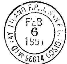
Illustration 11/11:: Illustration 11/12